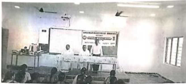
International Yoga day